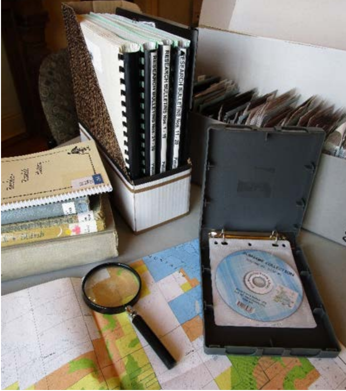
A sample of archival resources available at the Craigleith Heritage Depot.

The Blue Mountains Public Library celebrates Archives Awareness Week between April 1st-7th. Archives Awareness Week is an annual initiative of the Archives Association of Ontario (AAO). Archives, museums, and libraries across Ontario take this time to share a love of archival materials with the public in creative ways. This April, be sure to check out the hallway display case at L.E. Shore Library, which highlights maps and their fascinating value. Visit the Craigleith Heritage Depot to learn about a variety of maps in the collection that could help with your next research project.