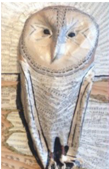
OWL BY ROISIN CADIEUX